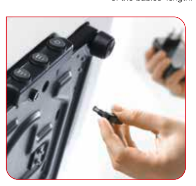
Can be operated by battery or power adapter.

Thanks to the additional measuring tape, the seca 727 enables a precise measurement of the babies' length.