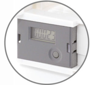
Optional counter tracks dispenser use