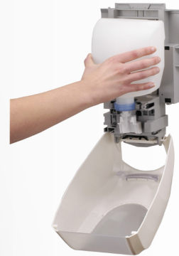
Quick and easy pump and bottle exchange