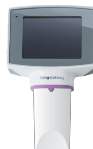
KVISO1 Multi-Use Display