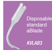
Disposable standard aBlade KVLAB3