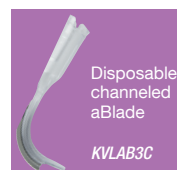
Disposable channeled aBlade KVLAB3C